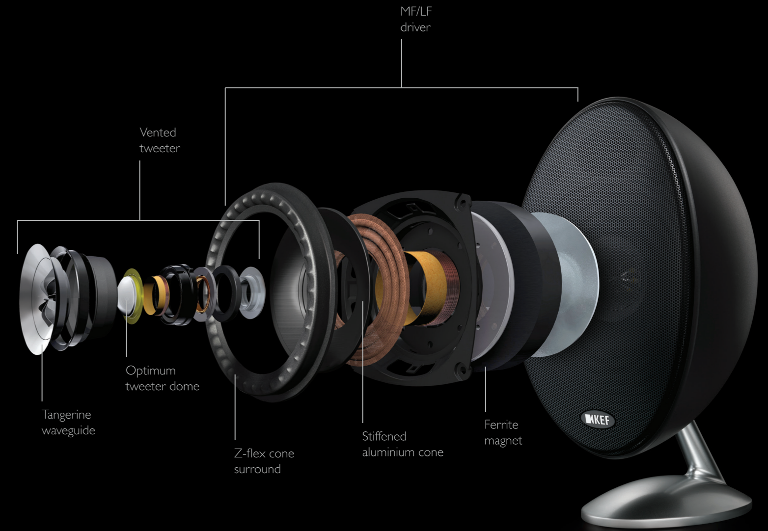
E301 Uni-Q driver array

Inspired by KEF's multiple award-winning 'egg' design, that revolutionised home entertainment with its rich, spacious and realistic 3D sound imagery, the new E Series packs uniquely advanced technologies in highly distinctive compact satellite speakers and a potent new powered subwoofer subtly styled to match. Available in deep black or pure white, the silky matt finish is complemented by satin chrome cast aluminium bases that simply rotate to form wall brackets. Bespoke optional floor stands are also available.